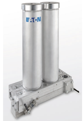
Eaton's TWF Twinfil 4000 filter systems are especially designed for gear lubrication systems in wind turbines. Each of the "filter pipes" holds one of Eaton's 01.NR.1000 filter elements and a 2-stage Twinfil filter element.

The custom designed TWF Twinfil filter system is fulfilling the requirements of the gearbox manufacturer. Essential was the success in reducing the weight of the filter systems by 78%, which was key to reduce the overall weight of the gearboxes. In this pilot project Eaton was providing more than 80 units of TWF Twinfil 4000 and 6000 filter systems for the different wind turbines in the park. Both have proven to de-aerate oil under all operating conditions, enhancing the reliability and efficiency of the gearbox and its lubrication system by assisting users in maximizing output while minimizing downtime and operating costs. An additional benefit for the gearbox manufacturer is that the new TWF Twinfil filter system meets all the relevant safety certifications for wind turbine applications worldwide.